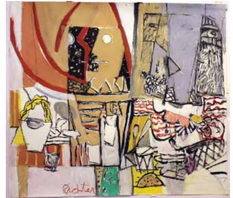
Anne Richter, The Couple # 1 , 2011, acrylic on paper, 50 by 56 inches

lines@artstudentsleague.org with your query and maybe you'll see it in the next issue!